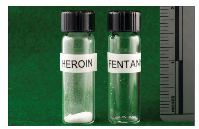
FATAL DOSES — HEROIN VS. FENTANYL: Recasus of its notency fentanyl can be leth

Fentanyl can be 50 to 100 times more potent than morphine or heroin.